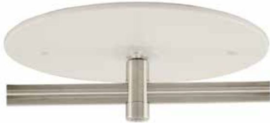
MTE-RC-150-12-WH-SN Monorail 150 Watt, 12 Volt Recessed Mount Electronic Transformer in Satin Nickel with White Canopy Finish.