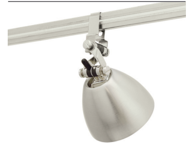
M-VES-SN-S1-SN Satin Nickel with Satin Nickel S1 Shade