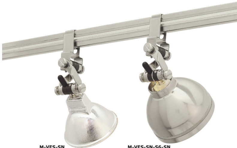
M-VES-SN Satin Nickel with MR16 Lamp (sold separately) LED Compatible