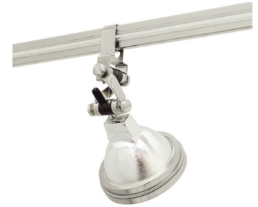
M-VES-SN-LH16-SN Satin Nickel with Satin Nickel Louver Lens Holder LED Compatible