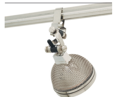
M-VES-PN-S7-PN Vespa in Polished Nickel with Polished Nickel S7 Shade LED Compatible