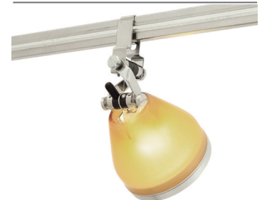
M-VES-SN-S3-AM-SN Satin Nickel with Satin Nickel S3 Amber Shade