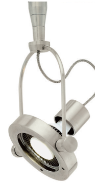
FJ-HAR-5-SN Fast Jack Harley in Satin Nickel with LED MR16 lamp