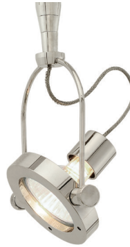
FJ-HAR-5-PN Fast Jack Harley in Polished Nickel