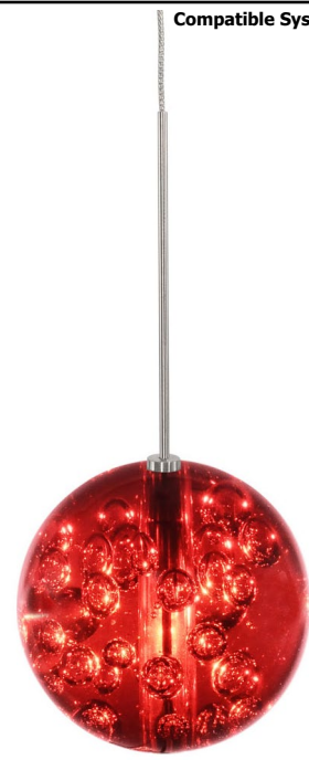
FJ-BBRD-10FT-12-SN Ruby Red