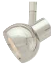
FJ-ADA-3-PN Polished Nickel