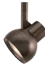
FJ-ADA-3-BZ Antique Bronze