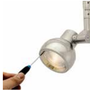
Locking lens orientation