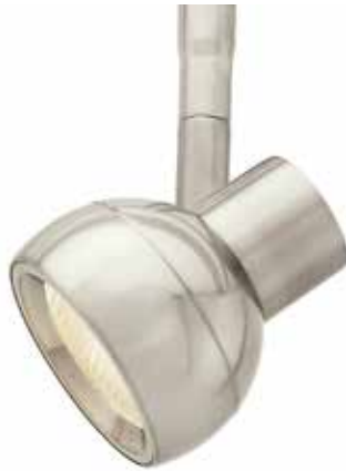
FJ-ADA-3-SN Satin Nickel