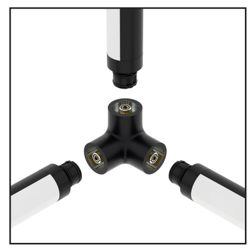
Patented Rotatable Connectors

to play around with flow and elevation. Its modular pieces and rotatable channels made it easy to determine the right lighting layout. 3000K with dimming and louvers were chosen to ensure perfect light levels for every activity.