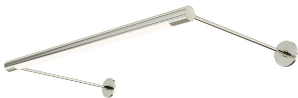
Shown in Chrome