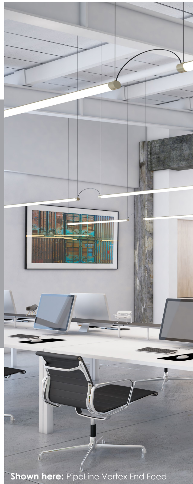
Shown here: PipeLine Vertex End Feed

The Pipeline Vertex Suspension lighting system brings together form, function and style. Each pipeline channel can be arranged according to your vision, in sizes 2 feet to 10 feet. It offers an uninterrupted direct beam of glare-free light with a diffused white lens, as well as a center or remote power supply. The innovative flexibility of the system allows you to create the perfect functional lighting design for your space.