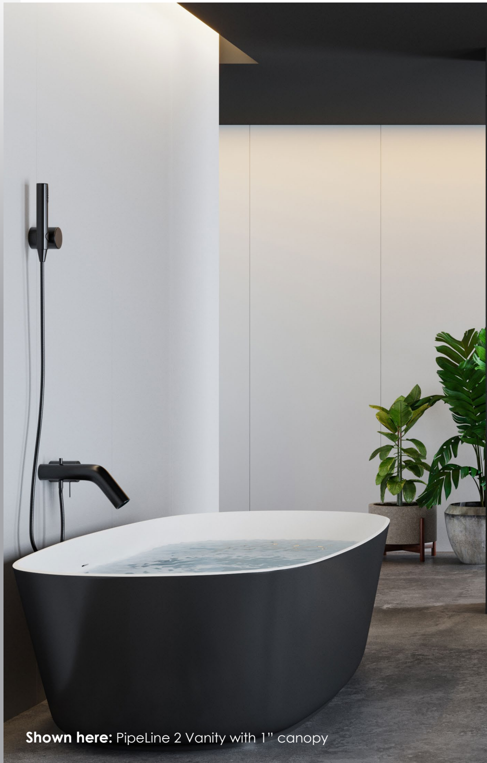
Shown here: PipeLine 2 Vanity with 1" canopy