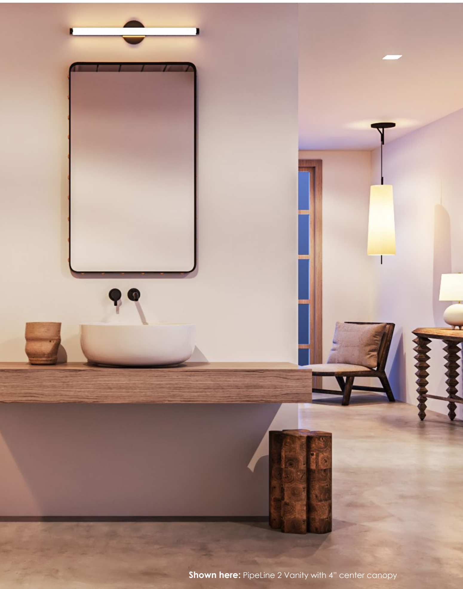
Shown here: PipeLine 2 Vanity with 4" center canopy