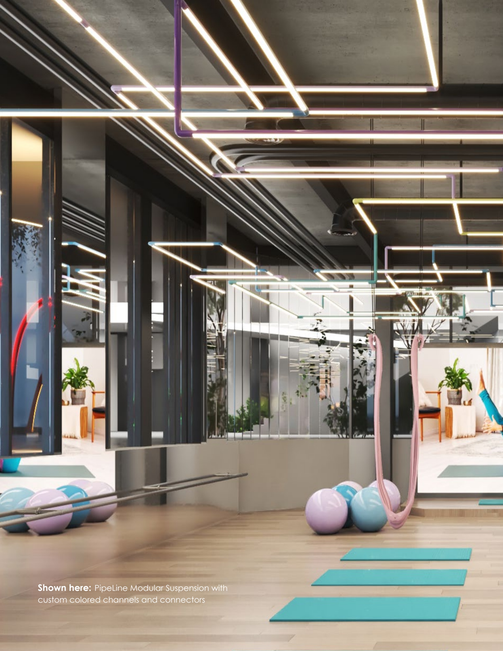
Shown here: Pipeline Modular Suspension with custom colored channels and connectors