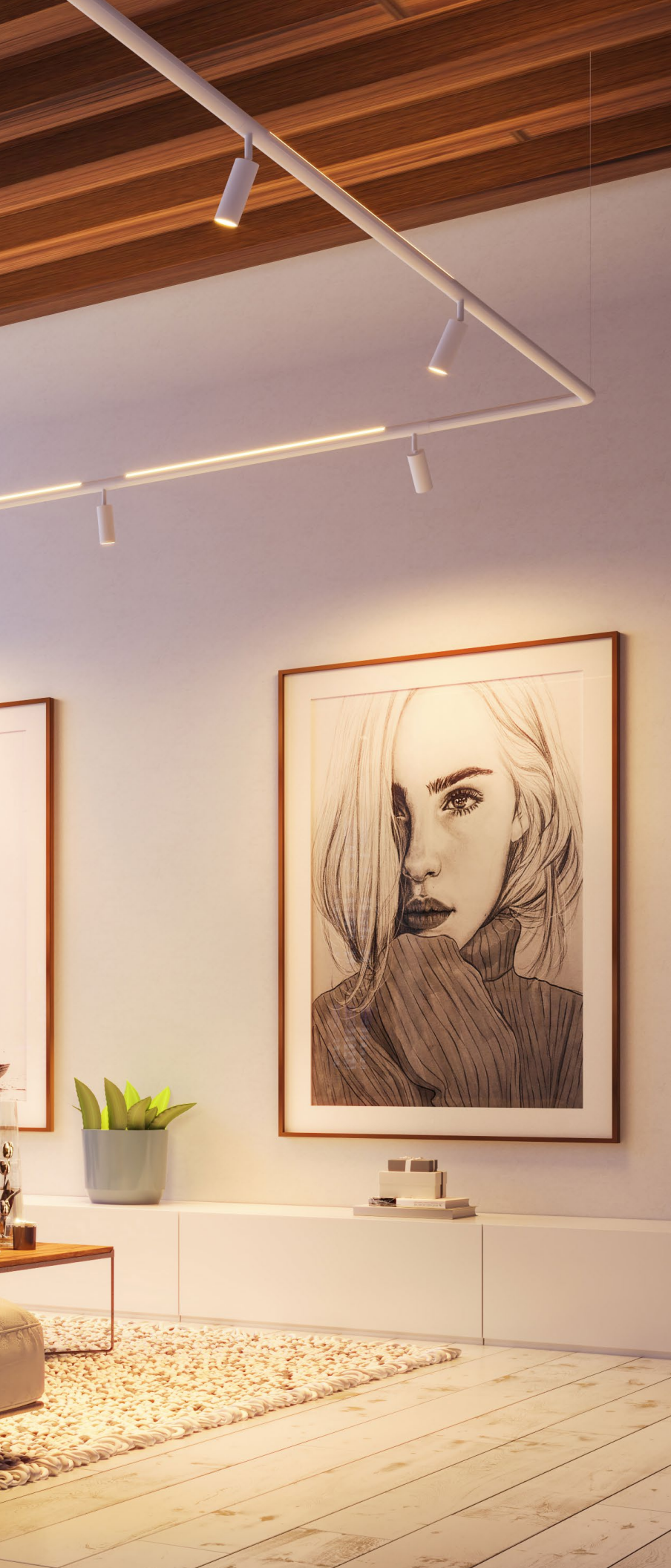
Shown here: PipeLine Modular Suspension with track heads in White