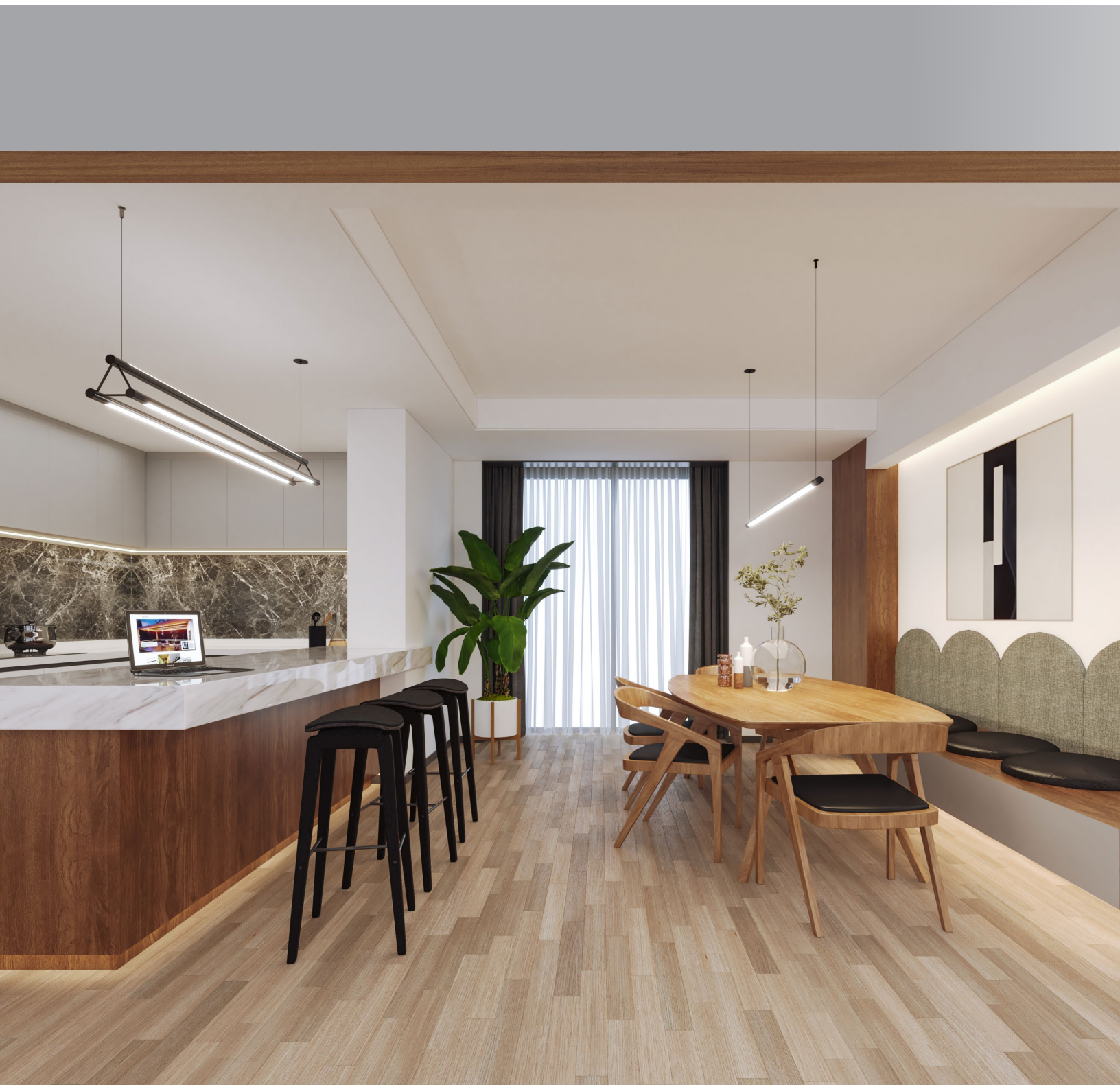
Shown here: Tri-Pipeline and Pipeline Linear Suspension in Black