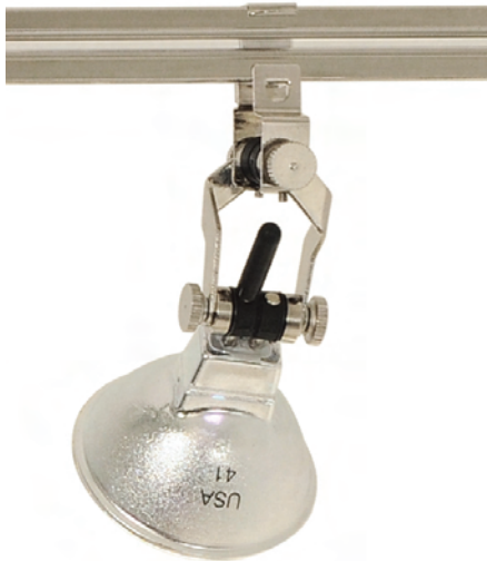
M-VES-SN Vespa in Satin Nickel with MR16 Lamp (not included)