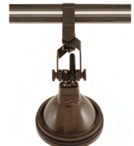
M-VES-BZ-LH16-BZ Vespa with LH16-BZ Louver Lens Holder in Antique Bronze