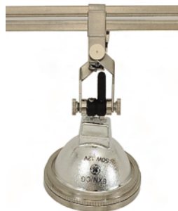
M-VES-SN-LH16-SN Vespa with LH16-SN Louver Lens Holder in Satin Nickel