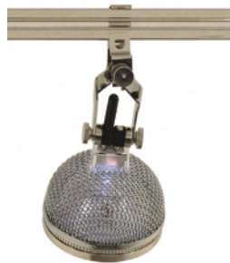
M-VES-PN-S7-PN Vespa with S7-PN Mesh Back Shade in Polished Nickel