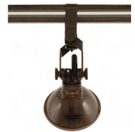
M-VES-BZ Vespa in Antique Bronze with MR16 Lamp (not included)