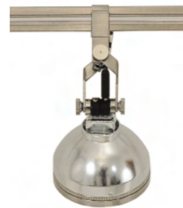
M-VES-SN-S6-SN Vespa with S6-SN Solid Back Shade in Satin Nickel