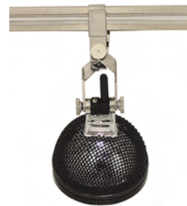
M-VES-SN-S7-BK Vespa with S7-BK Mesh Back Shade in Black