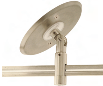
MP-4RD-SL2-SN Monorail 4" Round Power Feed Canopy shown.