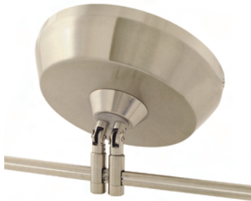
MT-600-D12-SL2-SN Monorail 600 Watt 12 Volt Dual Feed Surface Transformer shown.