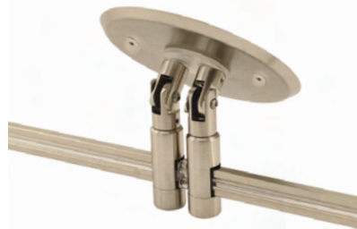
MPD-4RD-SL2-SN Monorail 4" Round Dual Power Feed Canopy shown.