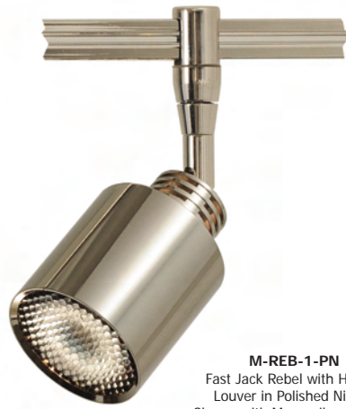
M-REB-1-PN Fast Jack Rebel with Hexcell Louver in Polished Nickel. Shown with Monorail connector.