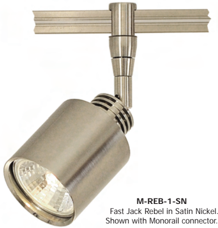
M-REB-1-SN Fast Jack Rebel in Satin Nickel. Shown with Monorail connector.