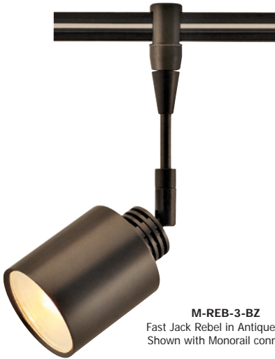
M-REB-3-BZ Fast Jack Rebel in Antique Bronze Shown with Monorail connector.