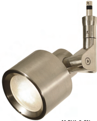
M-PHI-3-SN Fast Jack Phi shown.