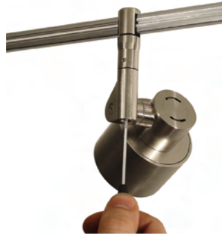
Hot aiming with self-locking tilt. M-PHI-3-SN shown.