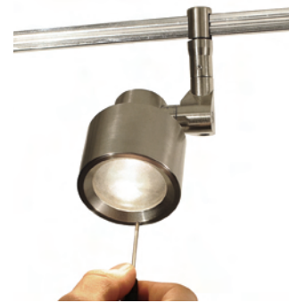
May lock lens. M-PHI-3-SN shown.