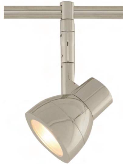
M-NEO-3-PN Neo in Polished Nickel. Shown with Monorail Fast Jack Connector.