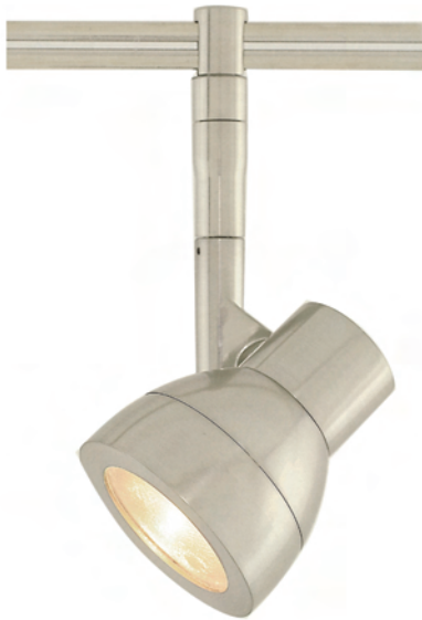
M-NEO-3-SN Neo in Satin Nickel. Shown with Monorail Fast Jack Connector.