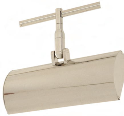
M-NAU-6-PN Nautilus in Polished Nickel. Shown with Monorail Fast Jack Connector.