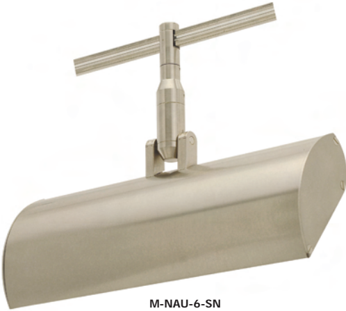
M-NAU-6-SN Nautilus in Satin Nickel. Shown with Monorail Fast Jack Connector.