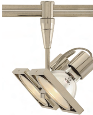
M-FOR-2SQ-3-PN Form Square 2-Head in Polished Nickel. Shown with Monorail Fast Jack Connector.