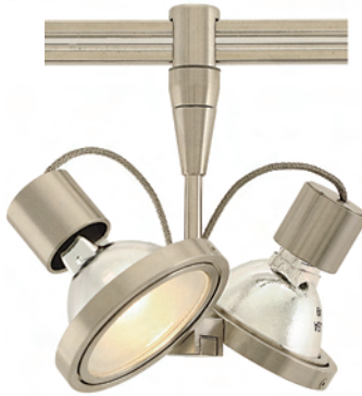
M-FORM-2RD-3-SN Form Round 2-Head in Satin Nickel. Shown with Monorail Fast Jack Connector.