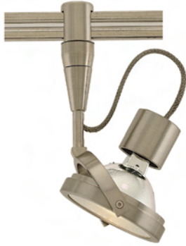
M-FOR-RD-3-SN Form Round in Satin Nickel. Shown with Monorail Fast Jack Connector.