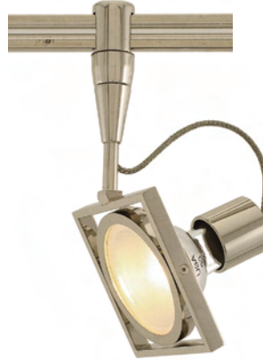
M-FOR-SQ-3-PN Form Square in Polished Nickel. Shown with Monorail Fast Jack Connector.