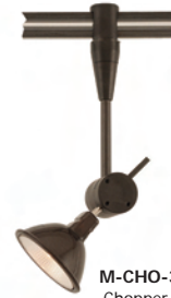
M-CHO-3-BZ Chopper with MR16 lamp in Antique Bronze