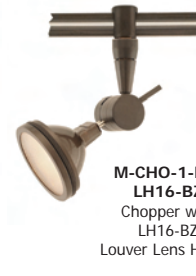
M-CHO-1-BZ-LH16-BZ Chopper with LH16-BZ Louver Lens Holder