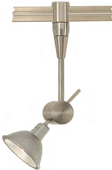
M-CHO-3-SN Chopper with Silver Back MR16 Lamp. Shown with Monorail Fast Jack Connector. (Lamp sold separately)