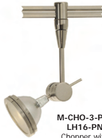
M-CHO-3-PN-LH16-PN Chopper with LH16-PN Louver Lens Holder