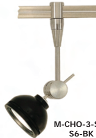
M-CHO-3-SN-S6-BK Chopper with S6-BK Solid Back Shade in Black