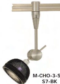
M-CHO-3-SN-S7-BK Chopper with S7-BK Mesh Shade in Black