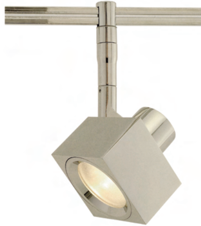
M-BOX-3-PN Box in Polished Nickel. Shown with Monorail Fast Jack Connector.