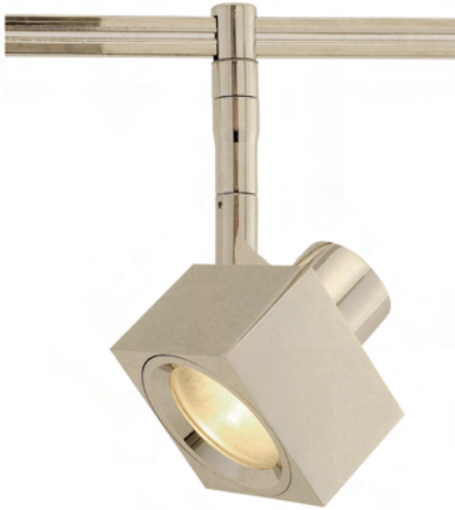
M-BOX-3-SN Box in Satin Nickel. Shown with Monorail Fast Jack Connector.