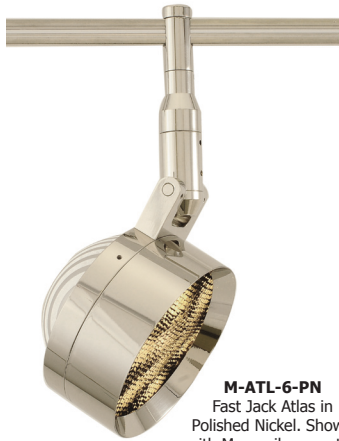
M-ATL-6-PN Fast Jack Atlas in Polished Nickel. Shown with Monorail connector.