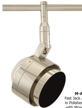
M-ATL-6-PN Fast Jack Atlas with snoot in Polished Nickel. Shown with Monorail connector.