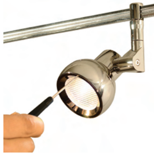
May lock lens. M-ADA-3-PN shown.