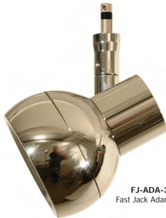
FJ-ADA-3-PN Fast Jack Adam shown.