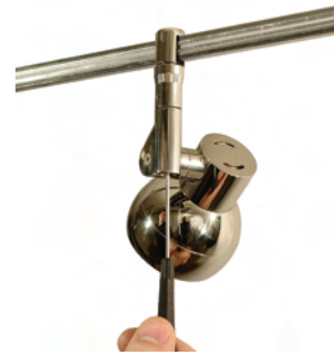
Hot aiming with self-locking tilt. M-ADA-3-PN shown.