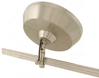
M2T-2x150-SL2-SN Monorail 2-Circuit 2x150 Watt, 12 Volt Surface Mount Transformer with 2" Slope shown.