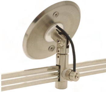
M2P-4RD-SL2-SN Monorail 2-Circuit 4" Round Power Feed Canopy with 2" Slope shown.